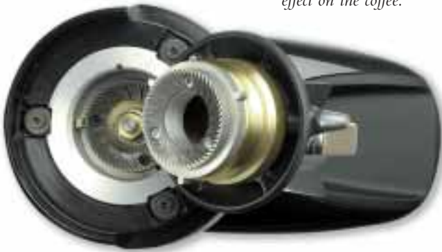
THE HEAD OF THIS GRINDER HAS BEEN REMOVED TO SHOW THE SHARP 'TEETH' WITHIN.

The best grinders have a high powered motor that operate the 'plates' at low revolutions per minute (below 1000rpm is good). These plates are like millstones and if they turn too fast, they get warm. This can have a detrimental effect on the coffee.